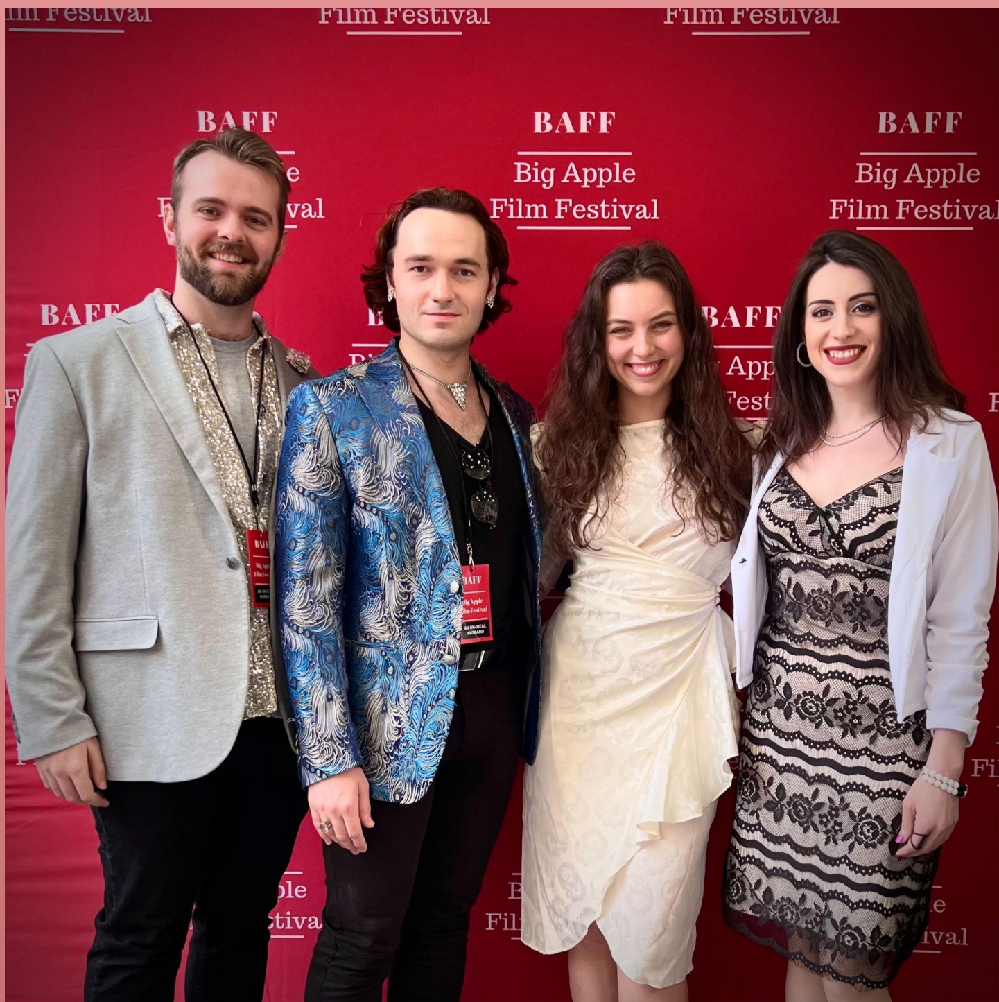
AN UN-IDEAL HUSBAND CAST. BIG APPLE FILM FESTIVAL, 2023. OFFICIAL SELECTION.